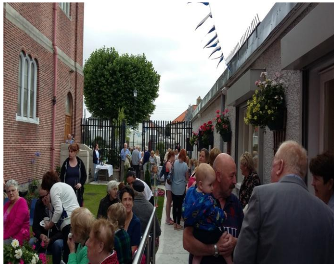
Christ the King Day Centre Garden official opening

The garden in Christ the King Day Centre was officially opened on the 24 th August. The project was funded by Dublin City Council. There was a large crowd in attendance and music and refreshments were provided for the celebration. There is a large elderly population in Cabra and this new entrance and recreational space is very welcome by the community, clubs and groups who attend there.